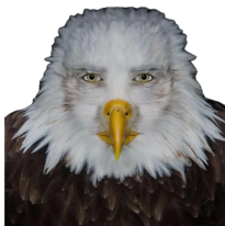
That’s it for issue 3! WASH MAH BELLEH!!!